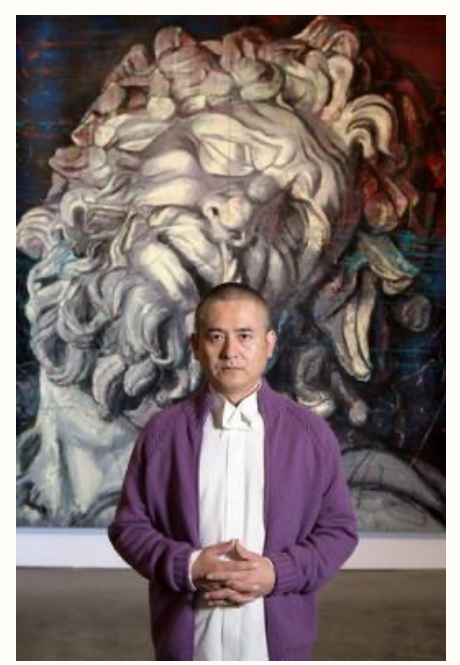
Zeng, ca. 2015

Read a <u>review</u> of Zeng's 2009 solo exhibition at <u>Acquavella Contemporary Art</u> in Whitehot Magazine.