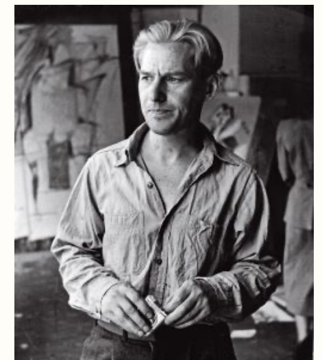
de Kooning, 1950

The Willem de Kooning Foundation de Kooning at Mnuchin Gallery, New York