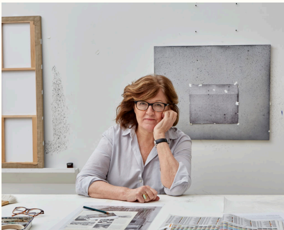
Celmins, 2018

Look through a learning resource about Celmins, including discussion prompts and activities produced by the National Galleries Scotland.