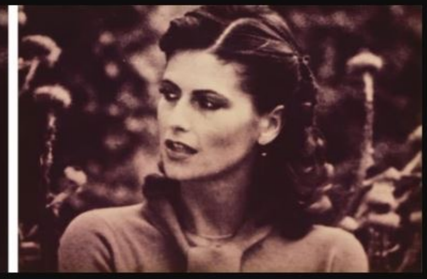
Richard Prince (American, b. 1949) Untitled (three women looking in the same direction), 1980 Three Ektacolor photographs, Ed. 3/10