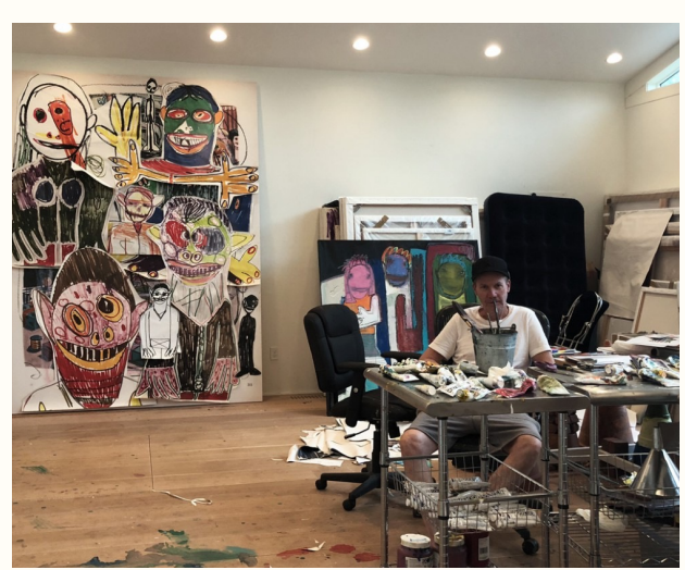
Prince in studio, 2018

Prince's 2014 exhibition at Almine Rech, <u>New Figures</u>, debuted a new series of found photograph cut-out collage drawings evoking the expressive lines of Matisse and surrealist juxtapositions of Picasso, in Prince's trademark style of cultural commentary.