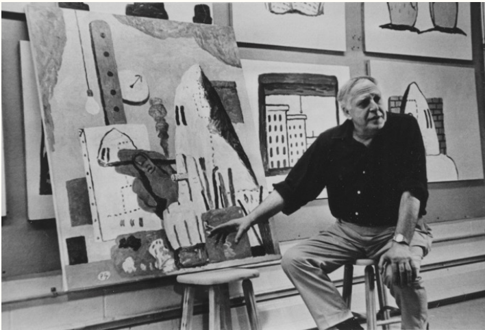
Guston with The Studio (1969), 1969