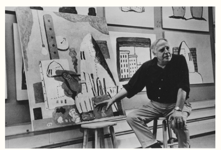
Guston with The Studio (1969), 1969