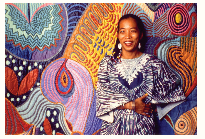
Abad, 1983

Pacita Abad: I Have One Million Things to Say was on view at MCAD Manila in 2018. The exhibition featured her trapuntos as emblems of her processes and materials made possible by her experience as a Filipina woman traveling the world as an expat's wife. Read the short exhibition catalogue produced for the show.