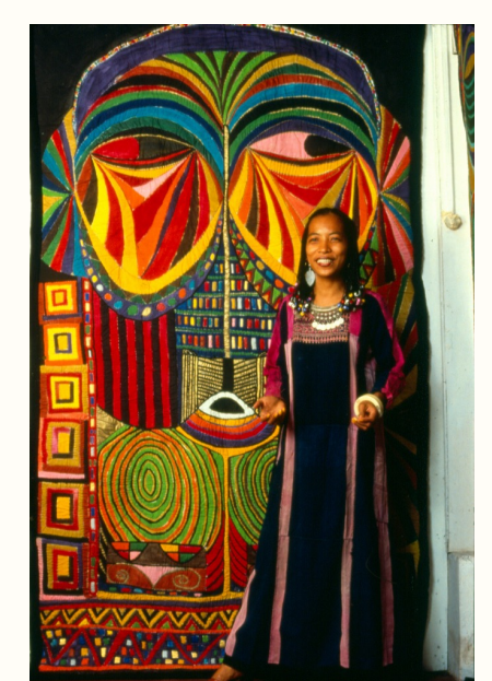
Abad with Bacongo I (1983), 1986

Spike Island installed Pacita Abad: Life in the Margins in 2020, the first exhibition in the UK by the Filipino American artist. Read a review in AWARE (Archives of Woman Artists Research & Exhibitions). Also watch a video about the exhibition on YouTube and an interview with Pio Abad on Vimeo.