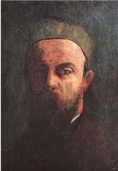
Redon self-portrait, 1880

In 2022, The Van Gogh Museum installed Andries Bonger and Odilon Redon: Kindred Spirits . The exhibition documented the friendship between Bonger, a collector, and Redon, an artist. It featured 30 works by Redon that were part of Bonger's collection.