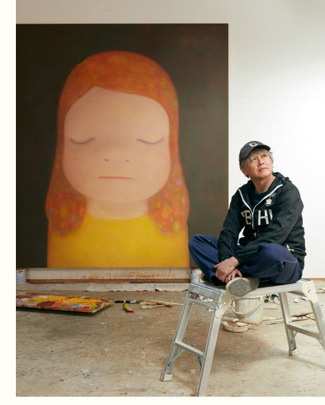
Nara in Tochigi Prefecture studio, 2020

<u>Nara's first solo exhibition in Hong Kong</u>, in 2015, brought together paintings, mixed-media drawings, photographs, and sculptures to capture twenty years of the enigmatic artist's explorations of interior life. "Instead of capturing one moment or creating something out of temporary emotion, I think I'm trying to create something more permanent in both artistic and aesthetic aspects," <u>Nara reflected in a video interview</u>.