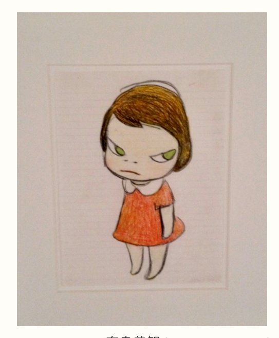
NARA Yoshitomo奈良美智 (Japanese, b. 1959) Knife Behand Back , 2000 Colored pencil on paper