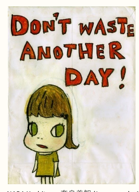
NARA Yoshitomo奈良美智 (Japanese, b. 1959) Don't Waste Another Day! , 2007 Colored pencil on paper