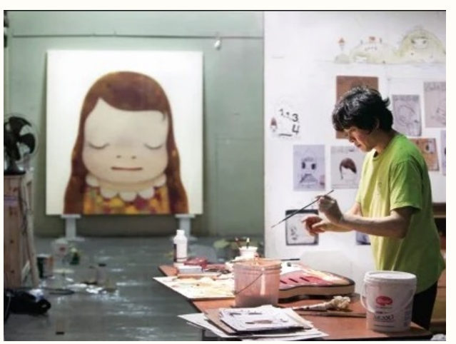
NARA in New York, 2010

In 2019, <u>Chateau La Coste</u> in Provence, France, brought together over 150 of NARA's drawings to explore the artist's relationship to the medium from his student days to the present. A "panoramic view" <u>as Nara referred to it</u>, of a lifelong pursuit as natural "as breathing itself," the show "contemplates the relationship I have with drawing, or how I've been getting along with it over time... Drawings shows what's inside, and then on the surface, there are paintings, sculptures and other works."