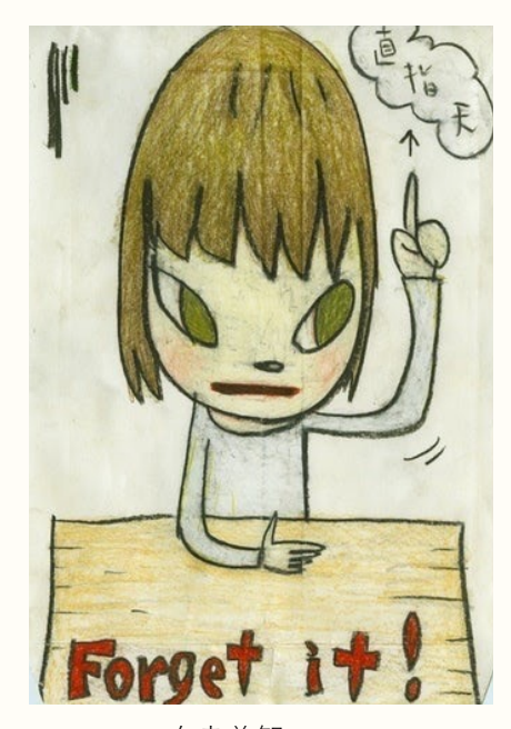
NARA Yoshitomo奈良美智 (Japanese, b. 1959) Forget it!, 2007 Colored pencil on paper