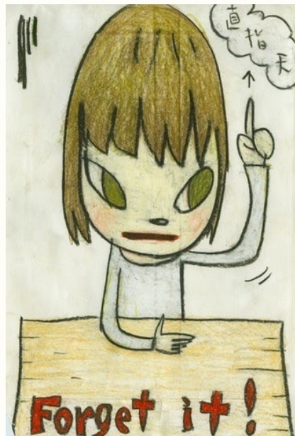
NARA Yoshitomo 奈良美智 (Japanese, b. 1959) Forget it! , 2007 Colored pencil on paper