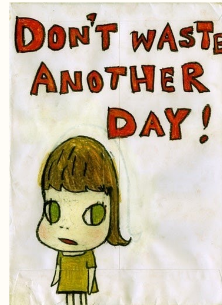
NARA Yoshitomo 奈良美智 (Japanese, b. 1959) Don't Waste Another Day! , 2007 Colored pencil on paper