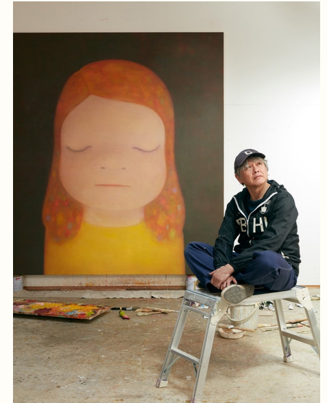
Nara in Tochigi Prefecture studio, 2020

Two major surveys of Nara’s work are scheduled to re-open to visitors in 2021. At Dallas Contemporary , paintings, drawings, and sculptures will trace the artist’s career from 2006. At LACMA , thirty years of work explore Nara’s interests in childhood, music, literature, Europe, Asia, and modern art. A monumental outdoor sculpture and an installation recreating his drawing studio complete the expansive retrospective , which will travel to the Yuz Museum in Shanghai, Guggenheim Bilbao, and Kunsthal Rotterdam. The New York Times Style Magazine: Singapore dropped by his Tochigi Prefecture studio for a lighthearted conversation .