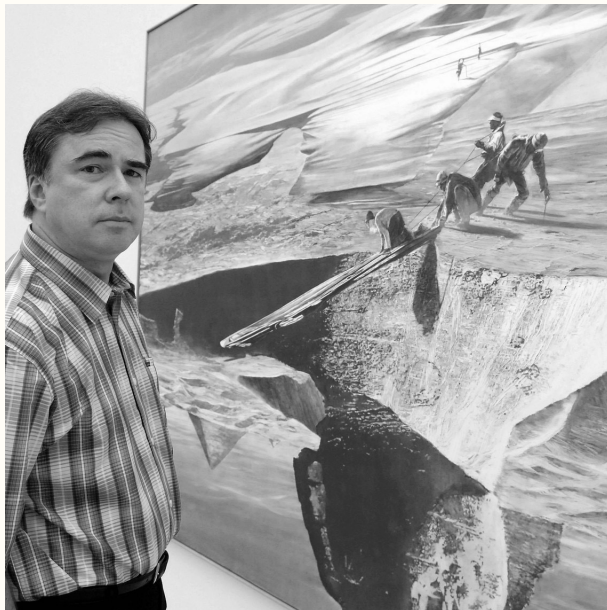
Tansey, unknown date

In 2005, Mark Tansey was the artist’s first solo exhibition in Germany, held at the Museum Kurhaus Kleve . The exhibition then traveled to Württembergischer Kunstverein in Stuttgart.