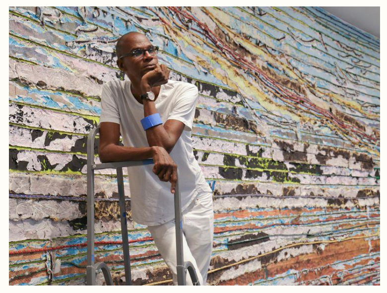
Bradford, 2019.

Bradford talked with Thelma Golden about his relationship with the medium of painting and experiences of being "othered" in a 2015 <u>video interview</u> in conjunction with his <u>first show at Hauser & Wirth</u> Gallery, New York. "Abstraction gave me the freedom to play... I want a space where I can play and be vulnerable and not know. In the shadows....my body is removed and stays in the shadows, what you see are the details and the things I'm working out."