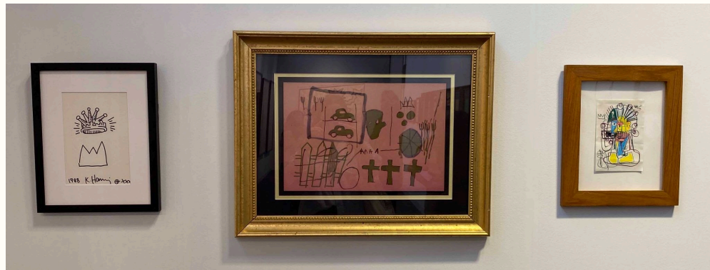
On display with Jean-Michel Basquiat, Untitled , 1980 and George Condo, George Imitating Basquiat , 1989

On view December 8, 2021 – March 13, 2022