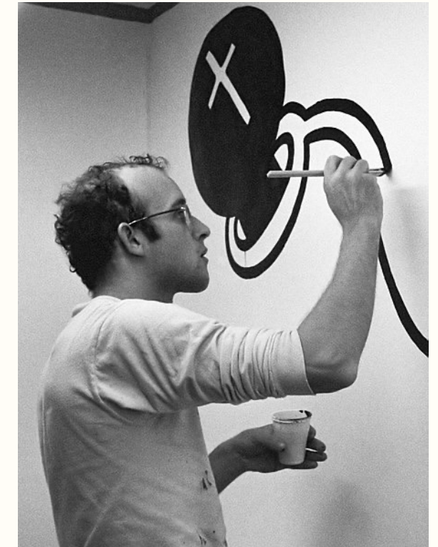
Haring, 1986 at the Stedelijk Museum, Amsterdam Photograph: Nationaal Archief

Haring, 1984, Photograph: Stuart William Macgladrie/Fairfax Media via Getty Images