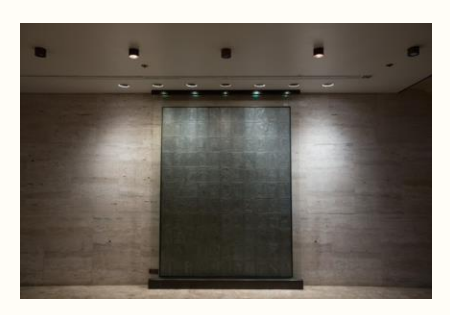
Jasper Johns, Numbers , 1964 at the Lincoln Center

One of the most significant American artists of the twentieth and twenty-first centuries, Jasper Johns is known for series of flags, targets, maps, letters, and numbers, and complex compositions that bring together objects and images from art, history, and daily life in a wide variety of media. In the 1960s, Johns completed a Sculp-metal painting entitled Number , 1964, for the Lincoln Center in New York. The artist intended to compliment the painting with a large-scale bronze cast sculpture and began creating wax forms in 1968. However, Johns was unable to realize the project until 2008, when he began a series of number-themed sculptures in bronze, aluminum, silver, and copper. 0 – 9 is one of the last iterations of the series. Though each cast featured unique markings by the artist, this is the only one to feature Johns' handprint. The imprint acts as a signature and asserts the importance of Johns' hand in the creation process. The handprint also harkens back to Numbers , 1964, which featured a cast of choreographer/dancer Merce Cunningham's (1919-2009) footprint, because Johns "thought it was an amusing idea to get Merce's foot into Lincoln Center."