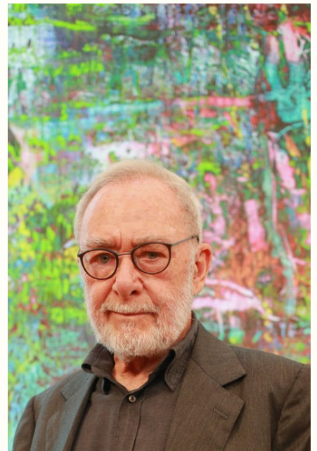
Richter, 2018