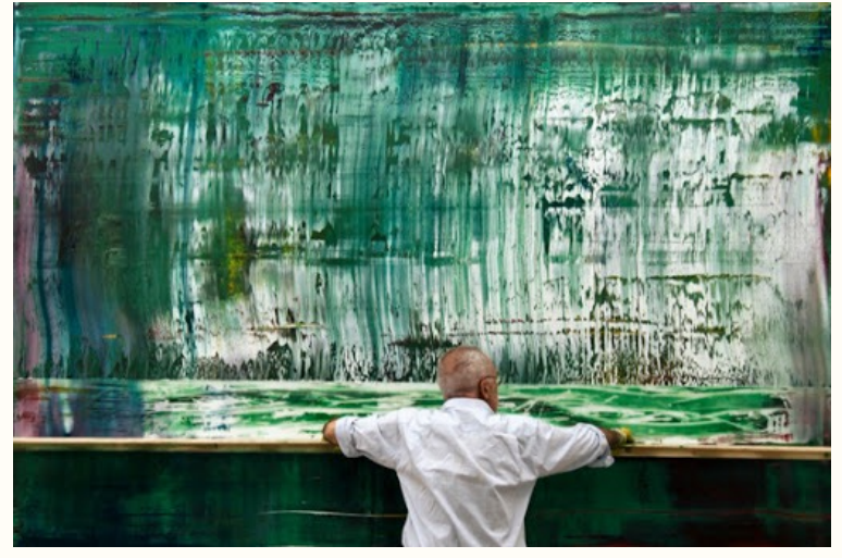
Richter at work, ca. 2011 Still from film, Gerhard Richter Painting

The Met Breuer's 2020 exhibition, Gerhard Richter: Painting After All explores the duality between representation and abstraction that underpins Richter's prolific six-decade career, emphasizing the value of painting as an artistic medium. Digital resources include an <u>exhibition guide</u> and a <u>virtual tour</u> of the galleries, as well as <u>interviews with artists</u> on Richter's continuing influence. Curator's also <u>contributed their insights</u>. "Ultimately, Richter's work is about pictorial and painterly traditions. Standing in front of a painting has more of a singular presence and relevance to our actual living moment than photography will ever have, because photography always marks the instant of passing—the death—of the very moment it records. It is this paradox, burrowed deep in Richter's work, that enables the image to continue to live, to be relevant."