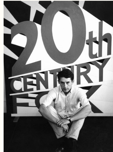
Ruscha, 1963 Photograph: Joe Goode