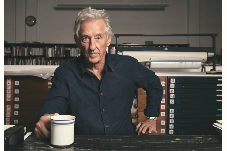
Ruscha, 2018

Oklahoma Contemporary Art will feature Ruscha for his first solo exhibition in his home state in 2021.