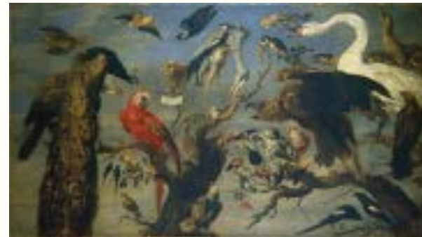
Snyders, Birds Concert , ca. 1630-40 oil on canvas

Cecily Brown's vivid fusions of abstraction and figuration, chaos and stillness, fantasy and reality, nature and flesh are forged from a deep love of painting as a medium and art history as a catalyst for inspiration. Beginning in 2019, she returned to her love of Renaissance masters to execute a series of grand-scale contemporary commentaries on the palettes, genres, and themes explored in seventeenth century works. With its evocative title, The Demon Menagerie takes on a motif known as "concerts of birds," popularized by Flemish painter Frans Snyders (1579-1657), which depict an array of