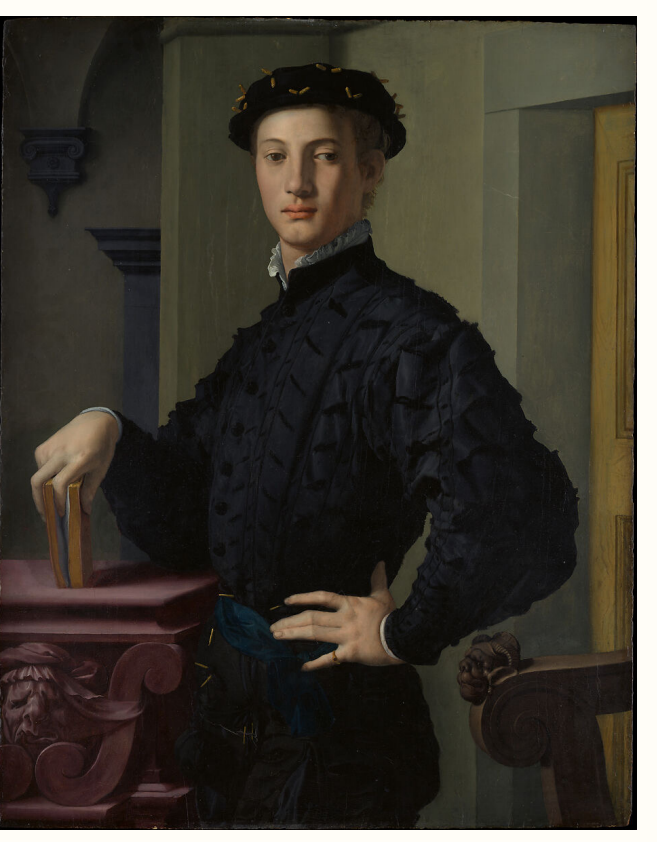
Bronzino Portrait of a Young Man, 1530s

In 2021, <u>The Medici: Portraits and Politics, 1512-1570</u> was on display at the Metropolitan Museum of Art in New York. Watch a <u>virtual opening</u> of the exhibition and a <u>video</u> about Bronzino's iconic portrait of the poet Laura Battiferri included in the display.