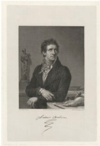
Antonio Canova engraving by William Henry Worthington, 1824

Canova: Sketching in Clay was co-organized by the Art Institute of Chicago and the National Gallery of Art in 2023. The exhibition focused on Canova's work in clay. Read a review of the exhibition catalogue in The Art Newspaper and a review of the exhibition in The Washington Post . Also read an in-depth article by Brigid von Preussen in Apollo Magazine . Watch a video produced by the Art Institute of Chicago, where modern-day sculptor Fred X Brownstein recreated Canova's 18 th century sculpture, Venus .