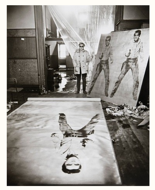
Warhol in New York studio, 1962

In 1977, <u>Warhol spoke with</u> his own Interview Magazine , which <u>he established in 1969</u> for underground film. "I'd rather do new stuff. The old stuff is better to talk about than to see. It always sounds better than it really is. New things are always better than old things," reflected Warhol on his career, the art business, money, and creativity.