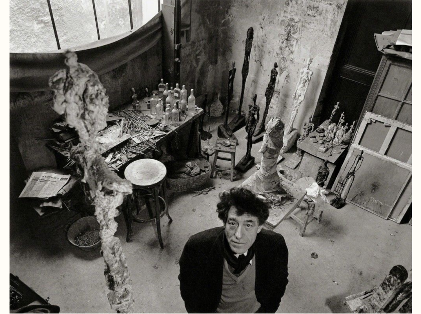
Giacometti in his atelier, 1957

The British Film Institute produced a short film in 1967 in conjunction with the Tate's exhibition, capturing Giacometti at work in his studio sketching from his own sculptures and hand-modeling clay maquettes.