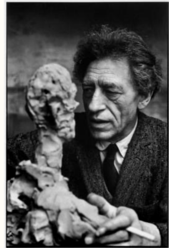
Giacometti, ca. 1960