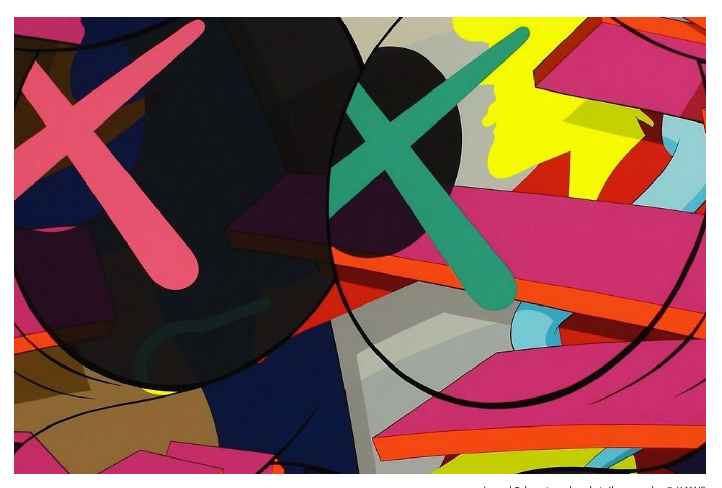
x's and 3d rectangles detail example. \ensuremath{\texttt{@}} KAWS