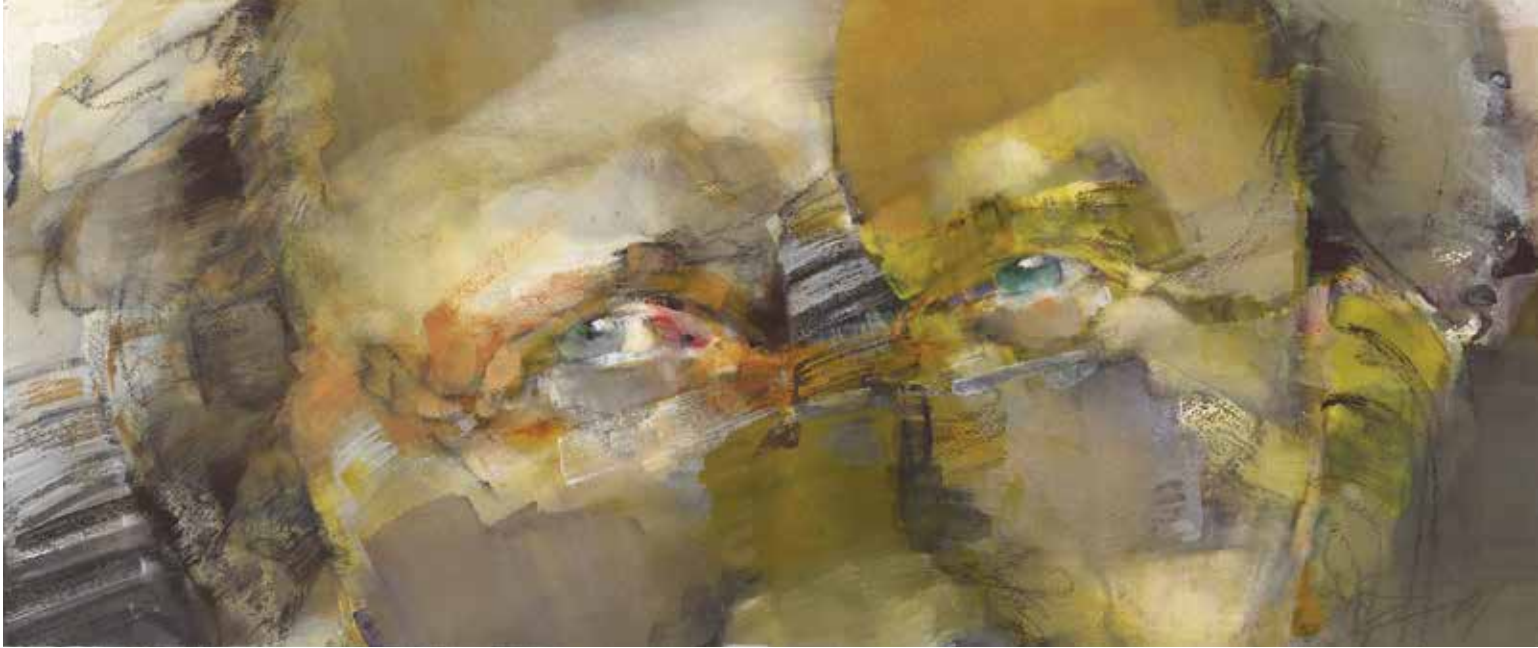
Jeannie McGuire, Confluence , 2016. Watercolor on paper, 12 x 27½ in.