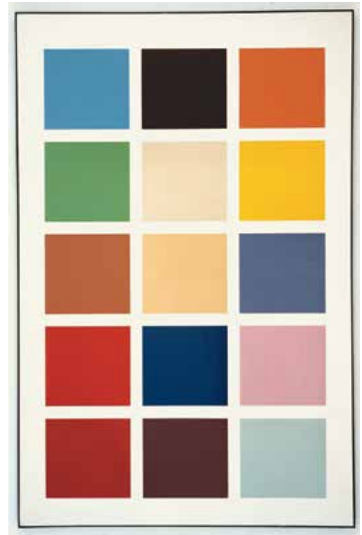
Gerhard Richter, Fünfzehn Farben (Fifteen Colors), 1966/1996. Enamel on canvas, 78 ¾ x 51 ⅛ in. Private Collection. L2016:157.6 (0057)

Throughout this spring and summer, the JSMA will exhibit five works spanning forty-plus years from the diverse oeuvre of Gerhard Richter. Shortly after finishing his studies at the art academy in Düsseldorf, Richter first entered geometric abstraction with Fünfzehn Farben ( Fifteen Colors ), 1966/1996, one of the earliest paintings in the Color Chart series, which he began by copying paint sample cards found in a local hardware store, rendering them mainly in slick enamels and lacquers. Richter spoke of the influence of Pop art during this initial series and described the charts as “an assault on . . . the way people glorified abstraction with such phony reverence.” As the series matured, he abandoned faithful representation with squares placed at random and shades subdividing into the thousands, the effect a pixelated, disorienting mass.