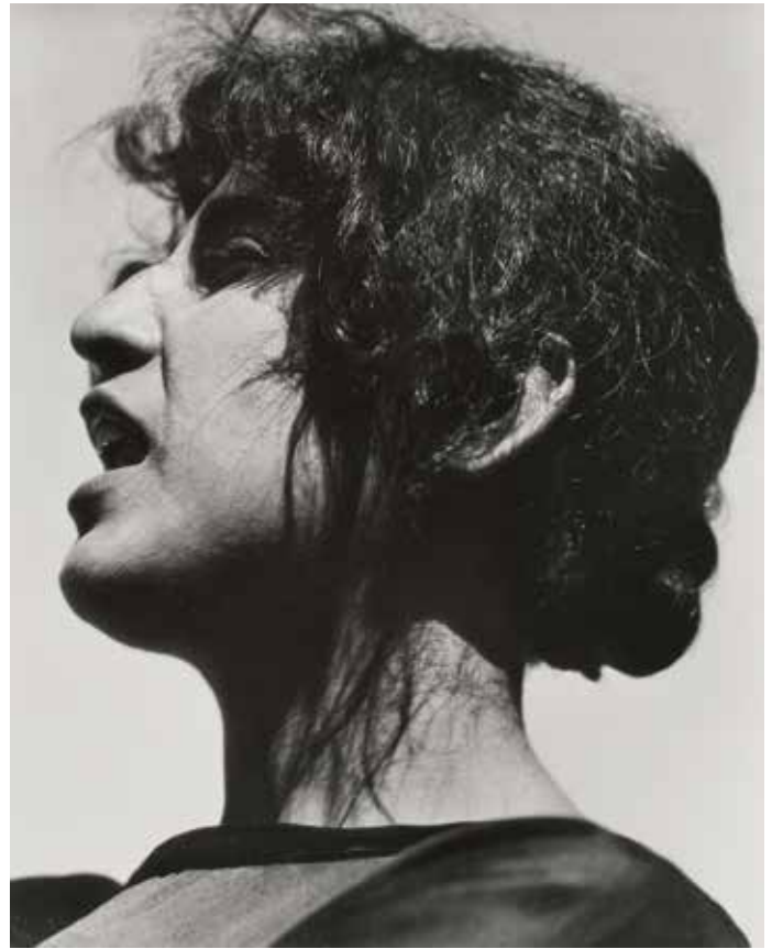
Edward Weston (American, 1886-1958). Guadalupe Marín de Rivera– Mexico , 1924. Gelatin silver print, 8 1/8 x 7 in. Gift of the Friends of the Museum, 1966:7