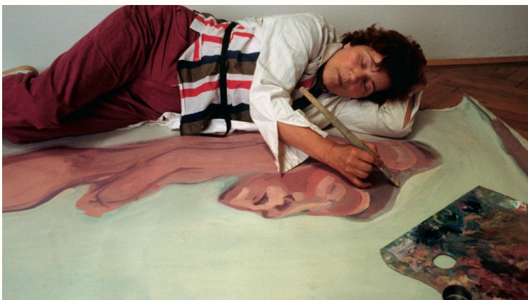
Lassnig painting in her Vienna studio, 1983