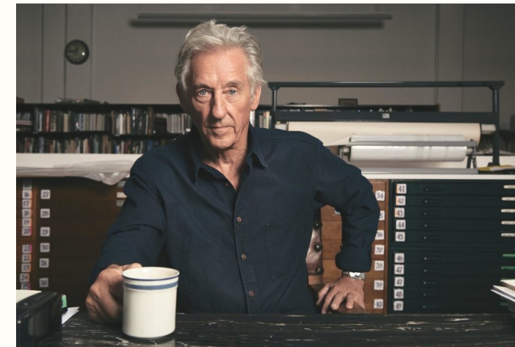
Ruscha, 2018

Oklahoma Contemporary Art will feature Ruscha for his first solo exhibition in his home state in 2021.