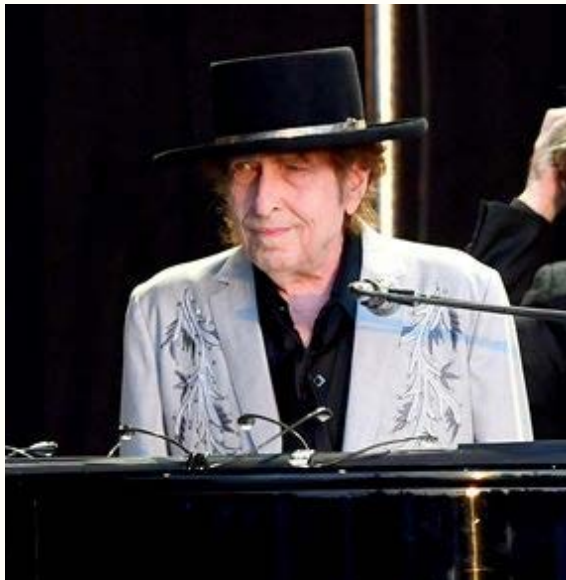
Dylan, 2019

In fall 2020, Dylan plans to open Heaven’s Door Distillery and Center for the Art , a new home for his line of signature whiskeys and artwork. In addition to the restaurant and performance venue, the space is intended to be a permanent home for his paintings and sculptures .