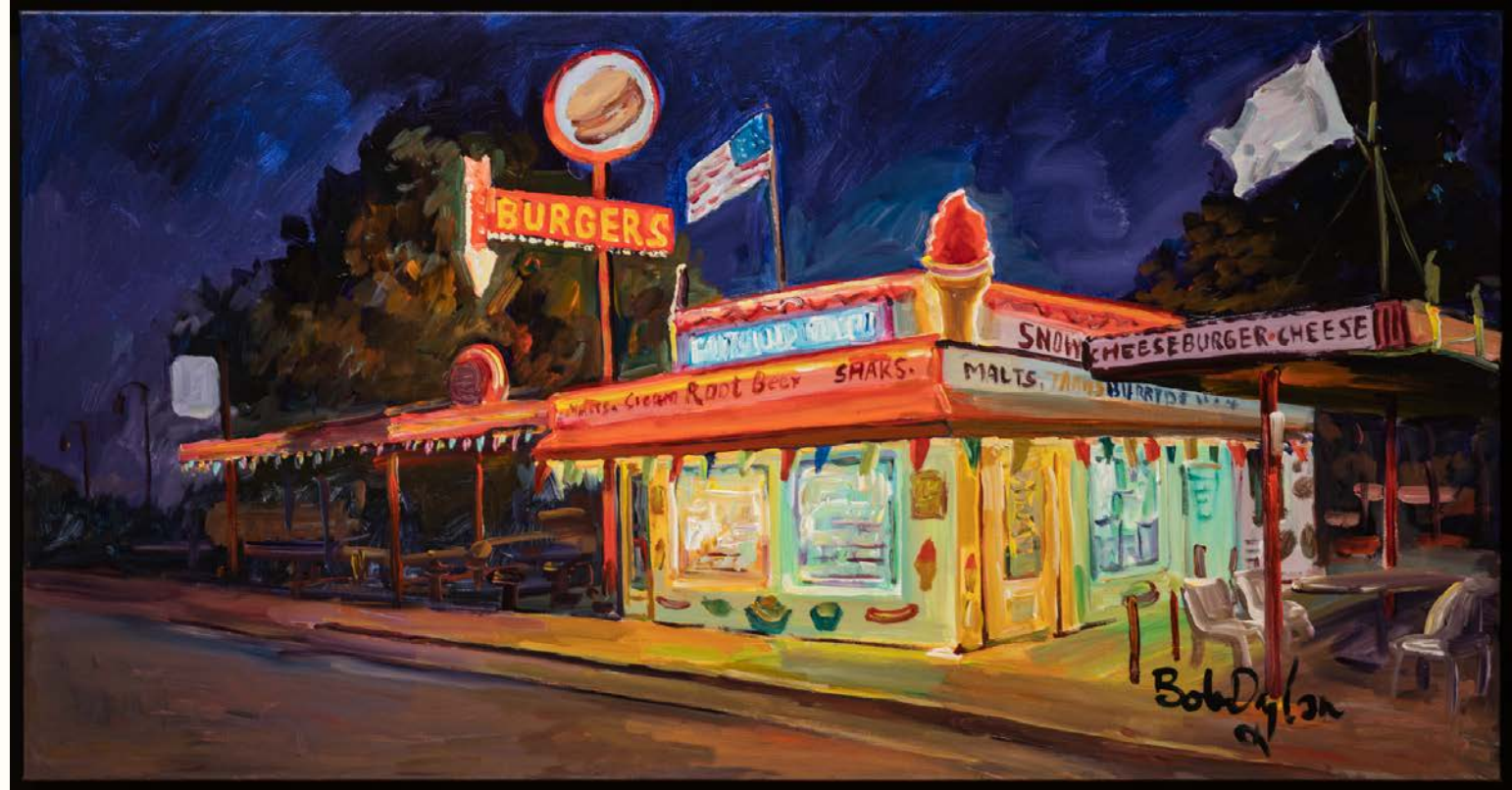
Bob Dylan (American, b. 1941) Nowhere and Anywhere , 2018 Acrylic on canvas