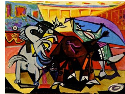
Francisco de Goya, Bullfight, Suerte de Varas , 1824, oil on canvas (left)