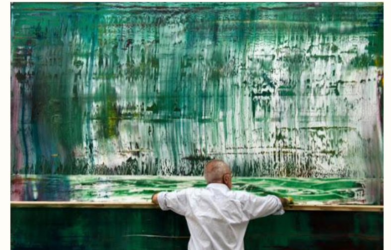
Richter at work, ca. 2011 Still from film, Gerhard Richter Painting

The Met Breuer’s 2020 exhibition, Gerhard Richter: Painting After All explores the duality between representation and abstraction that underpins Richter’s prolific six-decade career, emphasizing the value of painting as an artistic medium. Digital resources include an exhibition guide and a virtual tour of the galleries, as well as interviews with artists on Richter’s continuing influence. Curator’s also contributed their insights . “Ultimately, Richter’s work is about pictorial and painterly traditions. Standing in front of a painting has more of a singular presence and relevance to our actual living moment than photography will ever have, because photography always marks the instant of passing—the death—of the very moment it records. It is this paradox, burrowed deep in Richter’s work, that enables the image to continue to live, to be relevant.”