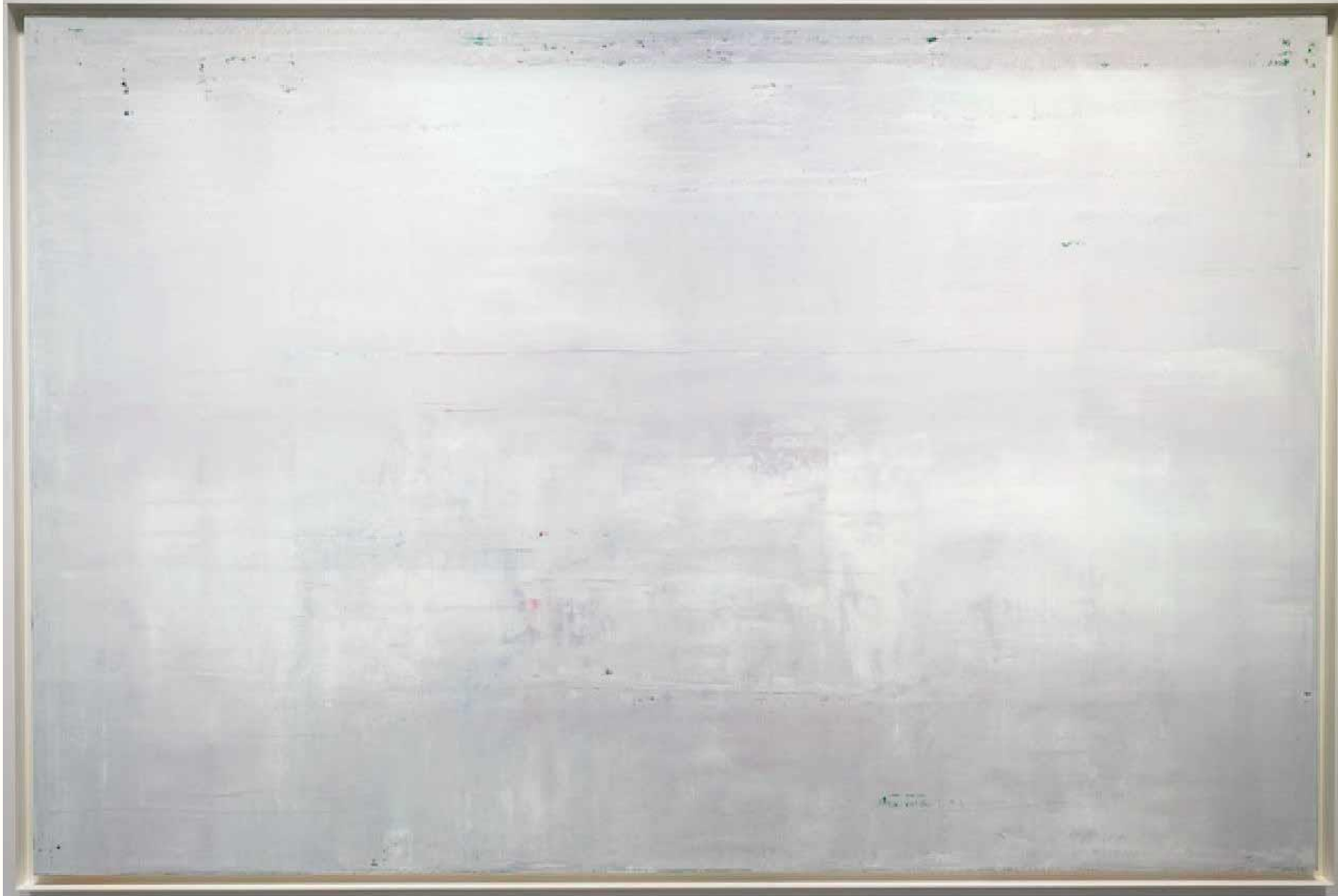
Gerhard Richter (German, b. 1932) Abstraktes Bild (Abstract Painting) , 2009 Oil on canvas