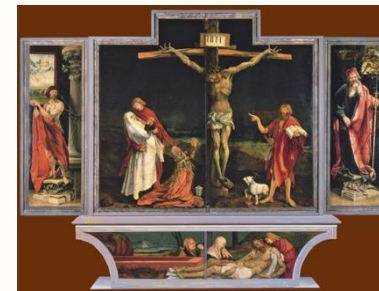
Nikolaus of Hagenauer and Matthias Grünewald Isenheim Altarpiece , 1512-1516 Musée Unterlinden

Gerhard Richter is perhaps best known for his oil paintings based on photographs, but the artist has also worked with watercolors throughout his career. Colmar I–V was made the same year as the international exhibition, von hier aus (from here) , which originated in Düsseldorf and traveled to multiple galleries in New York City, bringing a wide range of contemporary West German art to the attention of a broad American art public. This series was titled in homage to the Isenheim altarpiece in Colmar, France, made by German artists Nikolaus of Hagenauer and Matthias Grünewald in the 16 th century. Richter continues to discuss the altarpiece in interviews as one of the most impactful artworks he has encountered. In 2016, over 30 years after he produced this series, Richter said: “Art has value. Art offers solace. I recently visited Colmar and saw the Isenheim altarpiece, a tragic story! A great picture, it is wonderful, it is consoling, because it is beautiful.”