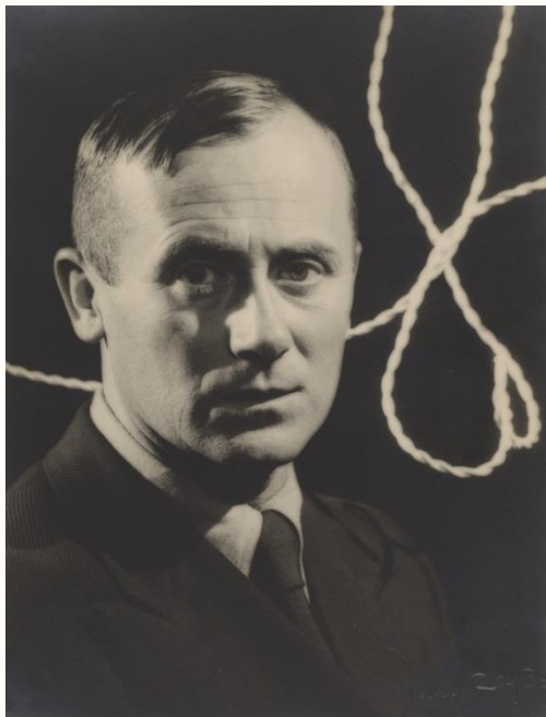
Miró, 1936

Miró returned to MoMA in 2019 for The Birth of the World , titled after the artist's seminal 1925 painting , which explored his burgeoning interest in the relationship between poetry and visual art.