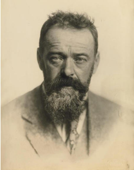
Hodler, 1908