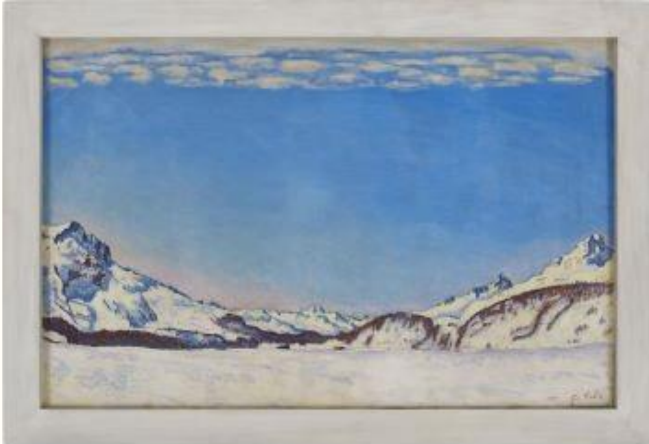
Ferdinand Hodler (Swiss, 1853-1918) Schnee im Engadin (Snow in the Engadin) , 1907 Oil on canvas