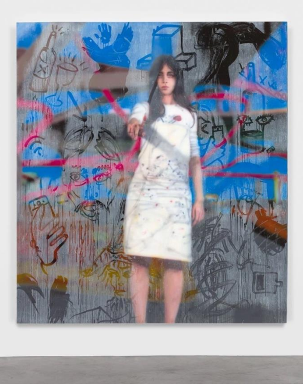
Avery Singer, Self-portrait (summer 2018) , 2018

In 2025, Avery Singer: run it back. exe was on view at the Serralves Museum in Porto, Portugal, her first institutional solo exhibition in Europe. The exhibition “grapples with the paradoxes of the digital era and the systematic tensions at the heart of contemporary society, exploring the confluences of art, technology and architecture.”