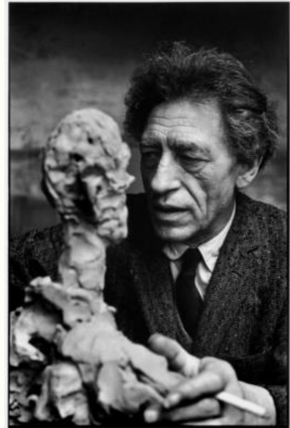
Giacometti, ca. 1960