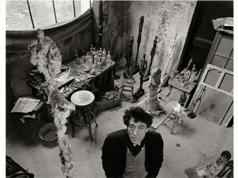
Giacometti in his atelier, 1957

In 2025, Encounters: Giacometti was launched at the Barbican in London as a series of programs and exhibitions that put Giacometti in conversation with contemporary artists including Huma Bhabha, Mona Hatoum, and Lynda Benglis.