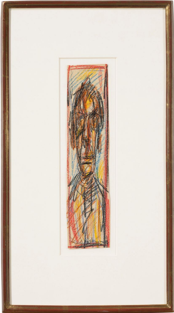
Alberto Giacometti (Swiss, 1901-1966) Tête d'homme , ca. 1955 Colored wax crayons on paper