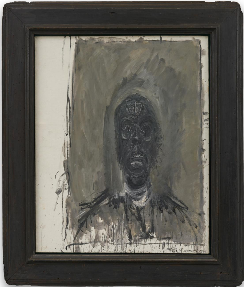
Alberto Giacometti (Swiss, 1901-1966) Grande tête noire (Large Black Head) , 1961 Oil on canvas