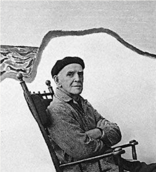
Avery, 1961