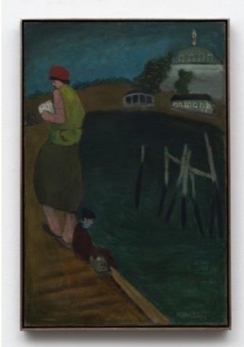
Milton Avery (American, 1885-1965) Untitled (Dockside Sketching) , c. 1930 Oil on canvas

Private Collection, Los Angeles; L2026:17.1