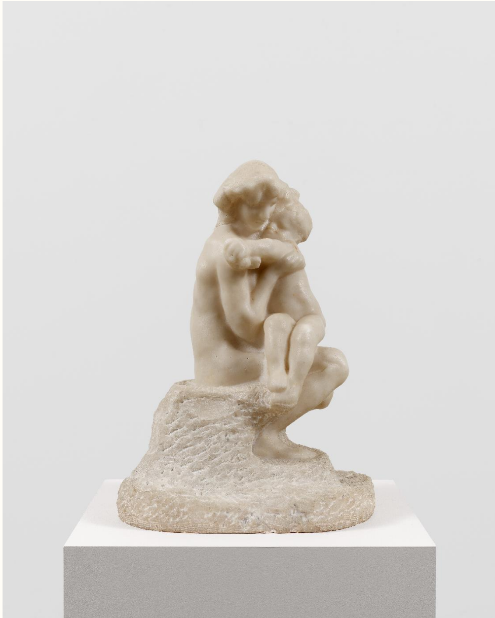
Auguste Rodin (French, 1840-1917) and Camille Claudel (French, 1864-1943) Frère et Soeur (Brother and Sister) , 1901-1904 Marble