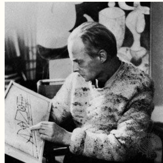
Klee in his studio, 1939

In 2022-2023, Paul Klee and the Secrets of Nature was at the Fundació Joan Miró. The same year, Zentrum Paul Klee installed the exhibition Paul Klee: About Technical Frenzy revealing “Paul Klee's artistic engagement with the technical achievements of his time.” Read a review in ArtDaily .