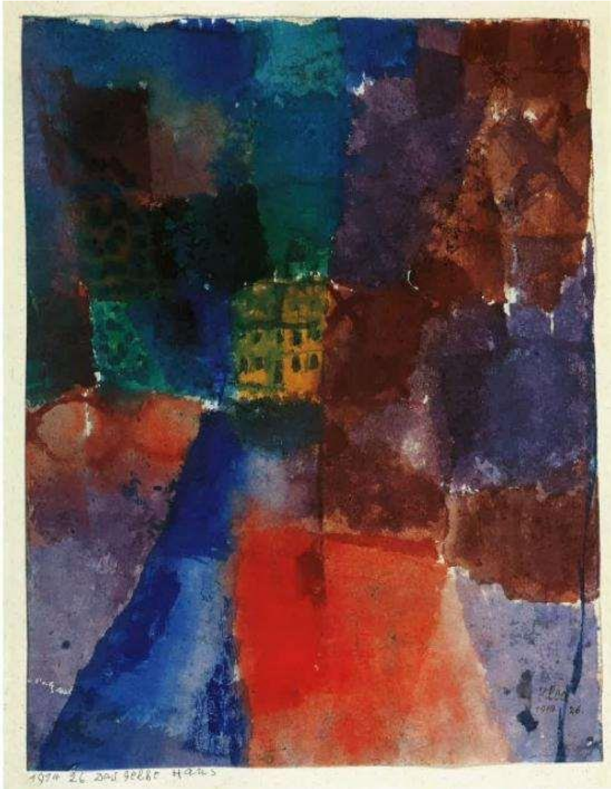
Paul Klee (Swiss-German, 1879-1940) Das Gelbe Haus (The Yellow House) , 1914 Watercolor on paper mounted on cardboard