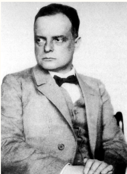
Klee, 1927 Photograph: Hugo Erfurth

The Guggenheim museum hosted Paul Klee 1879-1940: A Retrospective Exhibition in 1967. Read about the catalogue produced for the exhibition on the museum's website.