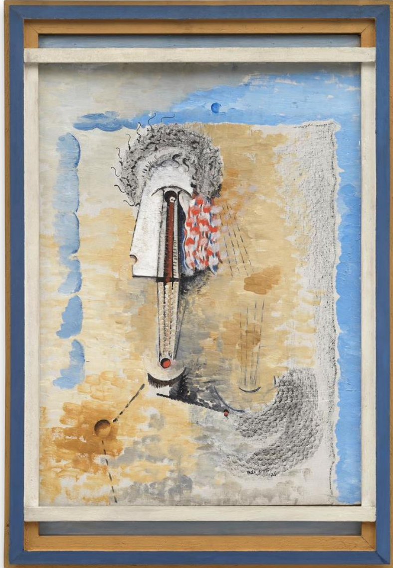
Max Ernst (German, 1891-1976) Untitled , 1926 Oil on canvas in artist's frame