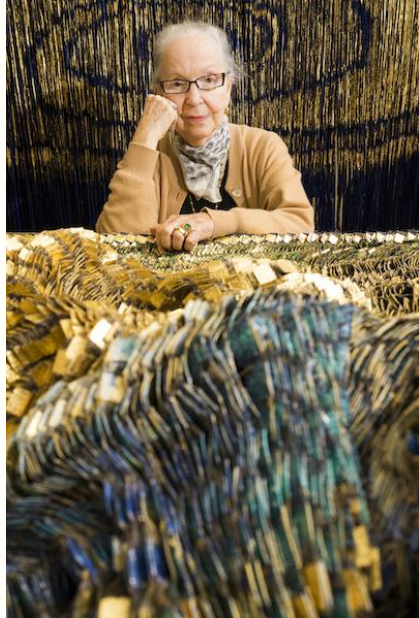
de Amaral, 2015