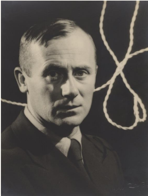
Miró, 1936

Fundació Joan Miró , the Joan Miro Foundation, Barcelona: center for study, art collection; biography, artwork, publications.