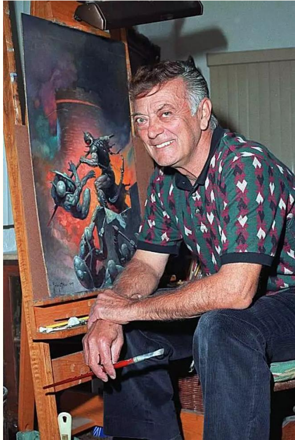
Frazetta, 1994