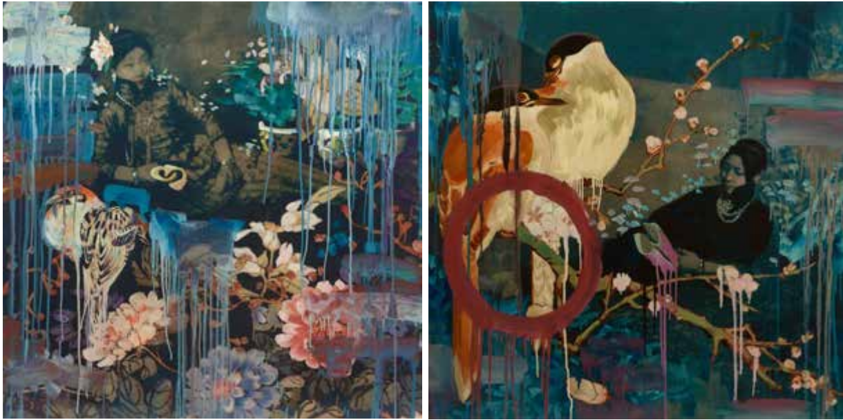
On the Grass I (left) and Fairy Tale – Blue (right), 2015