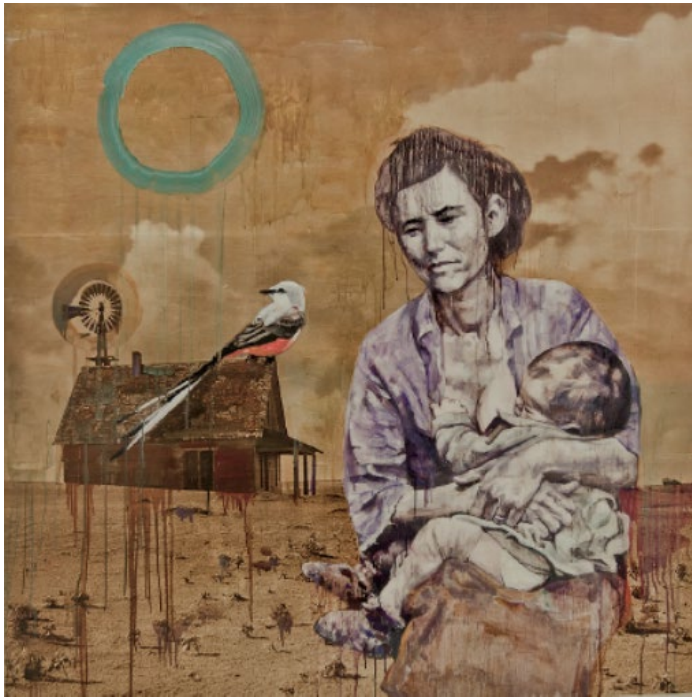
Hung LIU (LIU Hung 劉虹, Chinese-born American, 1948-2021) Oklahoma, 2021 Mixed media, 60 x 60 inches Proposed Acquisition, L2021:188.1

Chinese-born American artist Hung Liu (1948-2021) explores themes of history, memory, suffering, and social justice in her art. Characterized by layers of luminous color, drips, and gestural circles,