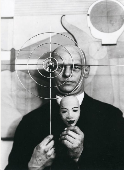
Oskar Schlemmer, Self Portrait with Mask , 1923