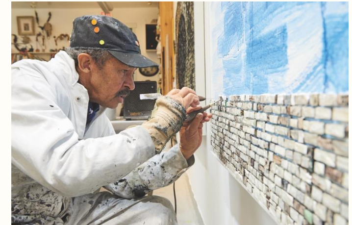
Whitten in the studio, 2017

Jack Whitten: The Messenger was a major survey exhibition at the Museum of Modern Art in New York installed in 2025 to wide acclaim, featuring his explorations of race, technology, jazz, love, and war. Read reviews in The New Yorker , Frieze Magazine , The New York Times , The Wall Street Journal , Art News , Artforum , and Cultured Magazine .