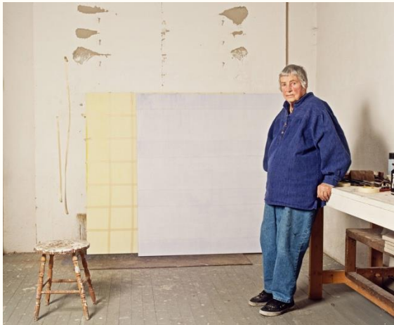
Martin in her studio, 2004

A 2015 retrospective was co-organized by the Tate and the Guggenheim . Read a Guardian article in anticipation of the exhibition detailing Martin's departure from New York to live in relative isolation in New Mexico. An Artsy article , “Elusive in Life, Agnes Martin Continues to Evade her Viewers in Death” explores similar themes. Also read a review in the New York Times , a Guggenheim blog , and a review in the New Yorker , “Agnes Martin, a Matter-of-Fact Mystic” about the collaborative exhibition.