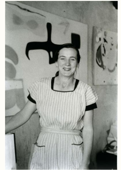
Martin in her studio, c. 1955

The Harwood Museum of Art in Taos, New Mexico is a long-time supporter of Martin's work. In 2012, the museum installed Agnes Martin: Before The Grid in honor of what would have been her 100 th birthday. Read an article about the exhibition in Taos News and a review in CAA .