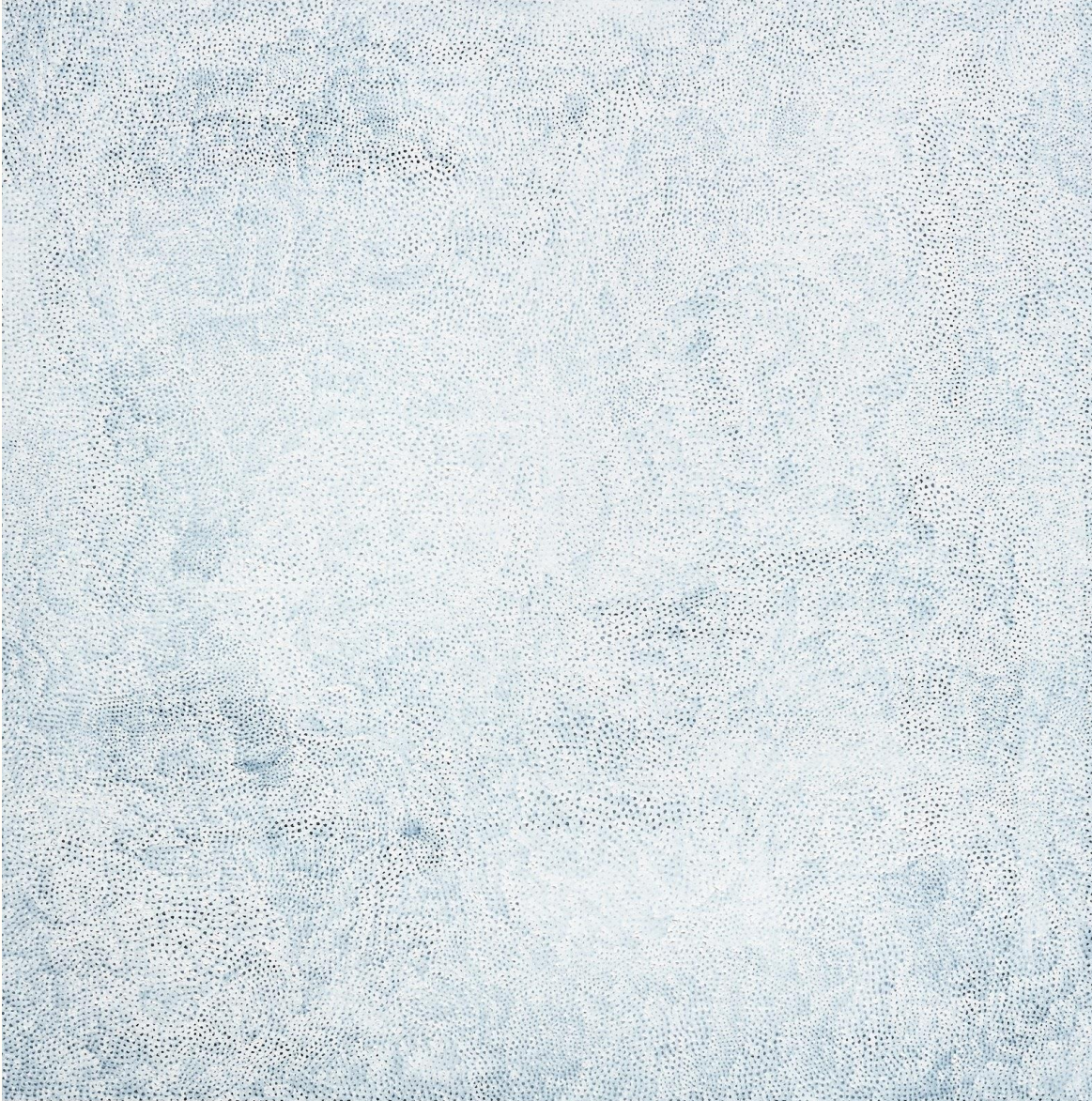
KUSAMA Yayoi 草間 彌生 (Japanese, b. 1929) White Infinity Nets , 2016 Acrylic on canvas

Private Collection, San Francisco; L2022:96.1