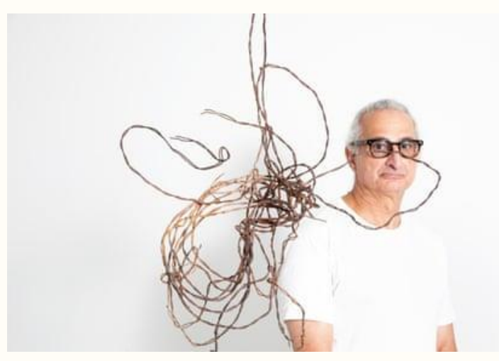
Wool, 2022

The Solomon R. Guggenheim Museum launched a solo exhibition in 2013, which featured Wool's characteristic abstract pattern paintings in the spiral architecture of the museum building. The exhibition later traveled to the Art Institute of Chicago. Read a review of the Chicago iteration in New City Art.