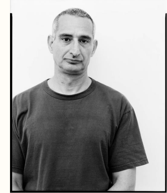
Wool, ca. 2020

In 1998, Christopher Wool traveled to the Museum of Contemporary Art in Los Angeles, the Carnegie Museum of Art in Pittsburg, and the Kunsthalle Basel in Switzerland. Read reviews of the MOCA edition in Artforum and the Carnegie edition in Carnegie Magazine Online.