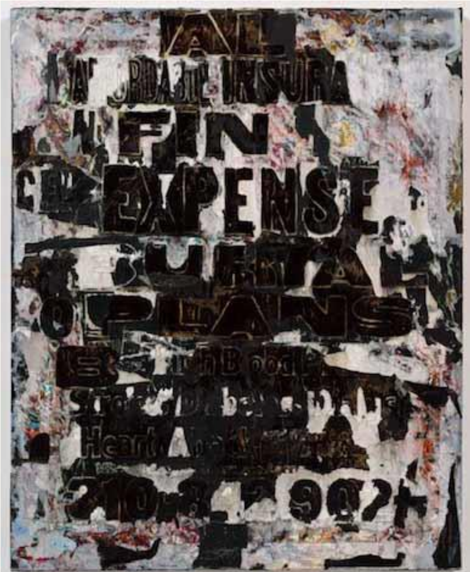
Mark Bradford (American, b. 1961) Fin , 2021 Mixed media on canvas