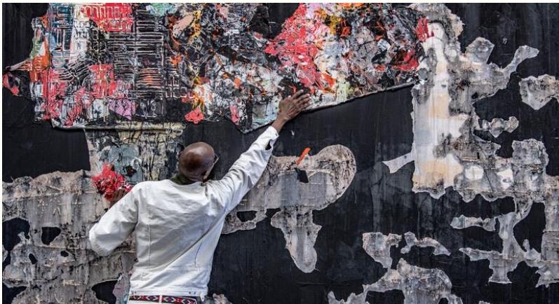
Bradford, 2019.

Bradford talked with Thelma Golden about his relationship with the medium of painting and experiences of being “othered” in a 2015 video interview in conjunction with his first show at Hauser & Wirth Gallery, New York. “Abstraction gave me the freedom to play... I want a space where I can play and be vulnerable and not know. In the shadows....my body is removed and stays in the shadows, what you see are the details and the things I’m working out.”