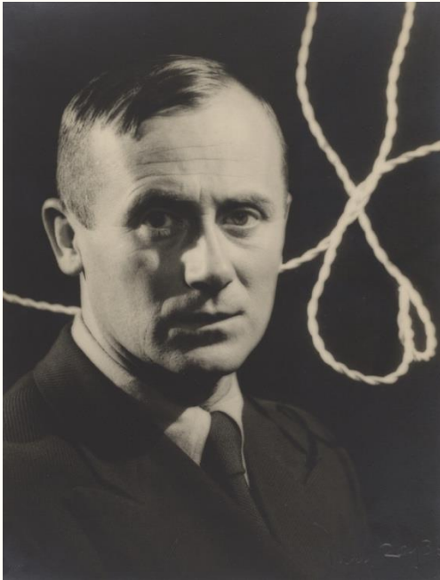
Miró, 1936

Fundació Joan Miró , the Joan Miro Foundation, Barcelona: center for study, art collection; biography, artwork, publications.