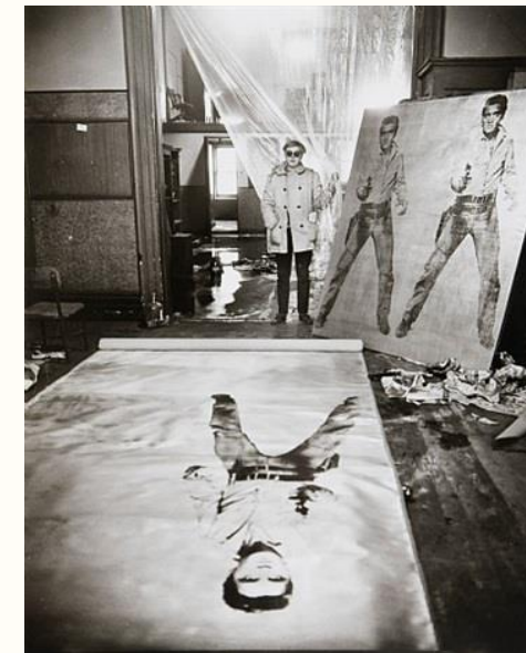
Warhol in New York studio, 1962

Warhol’s enigmatic and stubborn persona received in-depth treatment in a 2020 biography. The author spoke about his 500-page tomb and the nuance of researching the unreliable, mythic, and extremely popular artist.