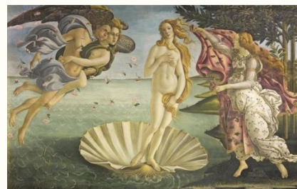
Sandro Botticelli (Italian, 1445-1510) Birth of Venus , ca. 1485 Tempera on canvas The Uffizi

Andy Warhol's Pop Art is known for its reflection on consumerism, celebrity, advertising, and pop culture in the mid-20 th century. However, the artist was also deeply engaged with art history. Details of Renaissance Paintings (Sandro Botticelli, Birth of Venus, 1492) is part of a series Warhol began in 1984 to reinterpret Italian Renaissance masterworks. In Warhol's version, the Botticelli Venus's iconic face and hair are cropped to fill the entire silkscreen. The composition mirrors Warhol's other celebrity portraits, turning the 15 th century Venus into a Pop Art superstar. As the artist once said: "My idea of a good picture is one that's in focus and of a famous person." As with everything Warhol said about his art, his comment contains equal elements of truth and quite deliberate misdirection, all delivered with a wickedly dry sense of humor and irony.