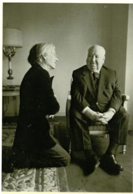
Andy Warhol and Alfred Hitchcock, 1974

Andy Warhol is one of the most influential artists of the 20 th century. Known for his iconic Pop Art style and celebrity status, Warhol was fascinated with fame, consumerism, advertising, and popular culture. His colorful silkscreen portraits often feature celebrities and “superstars,” from Marilyn Monroe and Elvis Presley to Mao Zedong. In 1974, Interview Magazine paired Warhol with infamous film director Alfred Hitchcock for conversation. The two enjoyed a morbid talk about death, murder, and the psychology of serial killers – a fascination the two filmmakers shared. Alfred Hitchcock was produced years later, as Warhol continued to reflect on Hitchcock’s monumental impact on cinema.