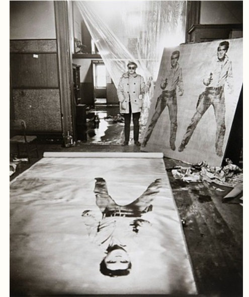
Warhol in New York studio, 1962

Warhol’s enigmatic and stubborn persona received in-depth treatment in a 2020 biography. The author spoke about his 500-page tomb and the nuance of researching the unreliable, mythic, and extremely popular artist.