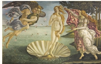
Sandro Botticelli (Italian, 1445-1510) Birth of Venus , ca. 1485 Tempera on canvas The Uffizi

Andy Warhol's Pop Art is known for its reflection on consumerism, celebrity, advertising, and pop culture in the mid-20 th century. However, the artist was also deeply engaged with art history. Details of Renaissance Paintings (Sandro Botticelli, Birth of Venus, 1492) is part of a series Warhol began in 1984 to reinterpret Italian Renaissance masterworks. In Warhol's version, the Botticelli Venus's iconic face and hair are cropped to fill the entire silkscreen. The composition mirrors Warhol's other celebrity portraits, turning the 15 th century Venus into a Pop Art superstar. As the artist once said: "My idea of a good picture is one that's in focus and of a famous person." As with everything Warhol said about his art, his comment contains equal elements of truth and quite deliberate misdirection, all delivered with a wickedly dry sense of humor and irony.