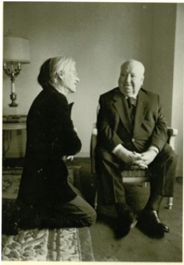
Andy Warhol and Alfred Hitchcock, 1974

Andy Warhol is one of the most influential artists of the 20 th century. Known for his iconic Pop Art style and celebrity status, Warhol was fascinated with fame, consumerism, advertising, and popular culture. His colorful silkscreen portraits often feature celebrities and “superstars,” from Marilyn Monroe and Elvis Presley to Mao Zedong. In 1974, Interview Magazine paired Warhol with infamous film director Alfred Hitchcock for conversation. The two enjoyed a morbid talk about death, murder, and the psychology of serial killers – a fascination the two filmmakers shared. Alfred Hitchcock was produced years later, as Warhol continued to reflect on Hitchcock’s monumental impact on cinema.