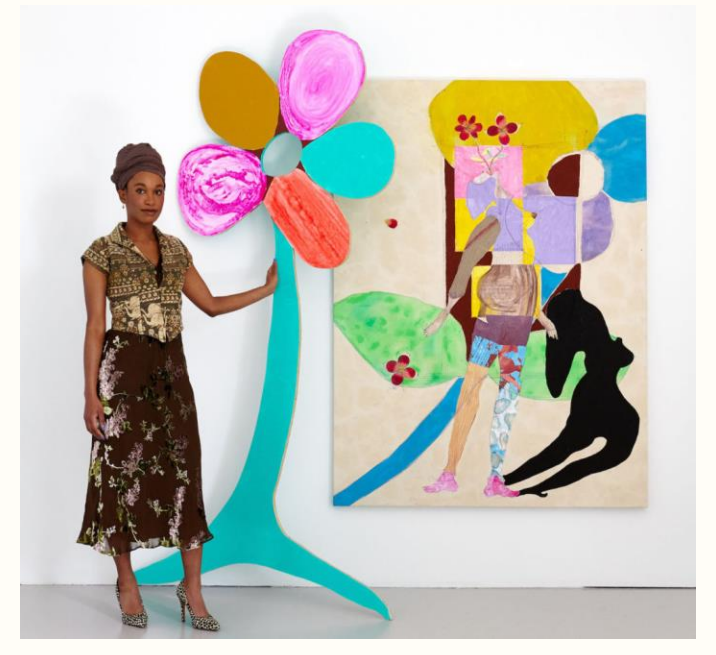
Self with Glory (2017) and Flowergirl (2017)

The Espoo Museum of Modern Art installed <u>Tschabalala Self: Around the Way</u> in 2024 as her first solo exhibition in Finland. Read an article about the exhibition in FAD Magazine.