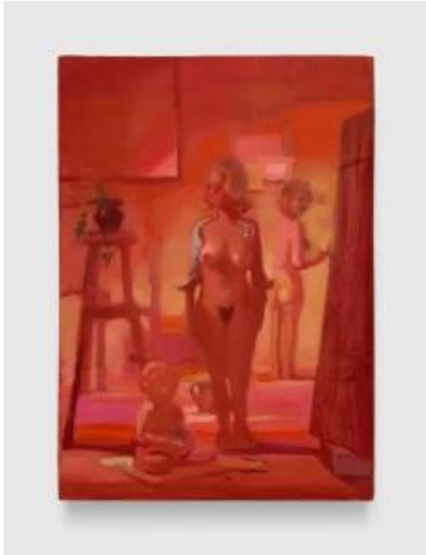
Lisa Yuskavage (American, b. 1962) KK and Co. , 2024 Oil on wood panel