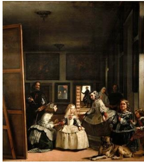
Diego Velázquez Las Meninas , 1656 Oil on canvas Museo Nacional del Prado, Madrid