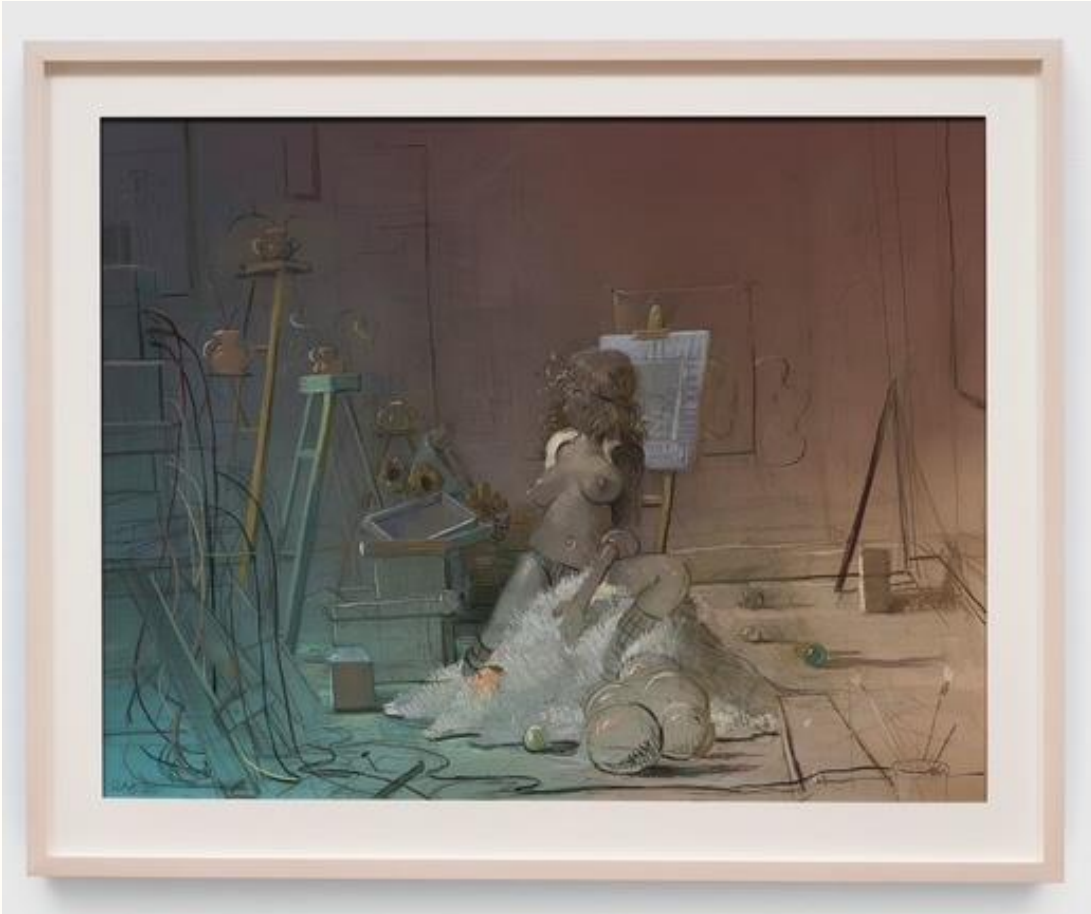
Lisa Yuskavage (American, b. 1962) Life Model , 2020 Pastel over inkjet print on rag paper