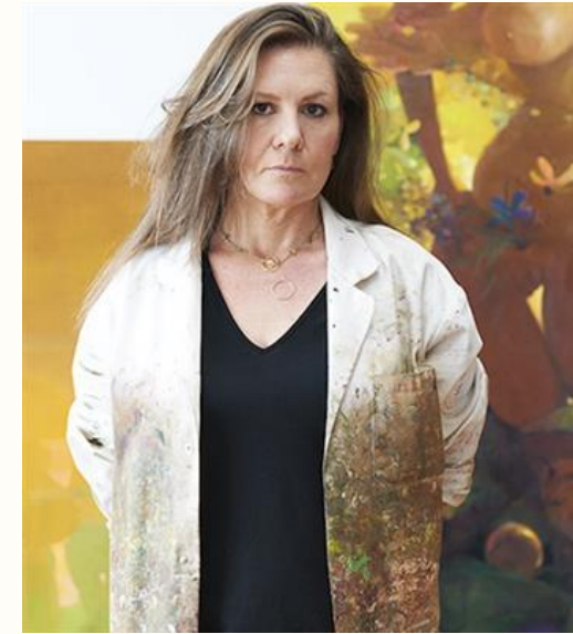
Yuskavage, c. 2017

Read Yuskavage's moving account of supporting a friend through an AIDS diagnosis and related death in the late 1980s and early 1990s. In 2021, the artist contributed a painting to a sale of contemporary art to benefit the New York City AIDS Memorial.