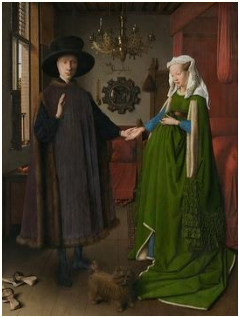
Jan van Eyck The Arnolfini Portrait , 1434 Oil on panel National Gallery, London

Rendezvous Behind the Artist’s Studio features a nude model posing next to a bowl of fruit in the foreground while a woman dressed in loose clothing sits at a nearby table. The narrative is complicated by the reflection of a photographer in the mirror – an homage to the infamously layered narratives that beguile viewers in paintings by Jan van Eyck (1390-1441) and Diego Velázquez (1599-1660).