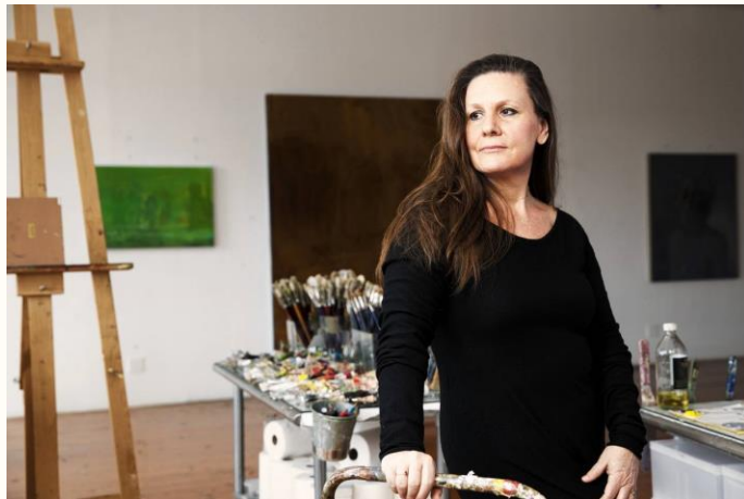
Yuskavage in her studio, 2014